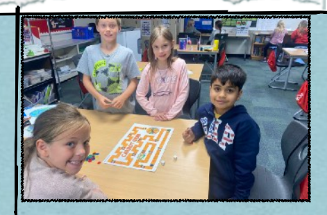
Students enjoy the math work place station, Carrot Grab.