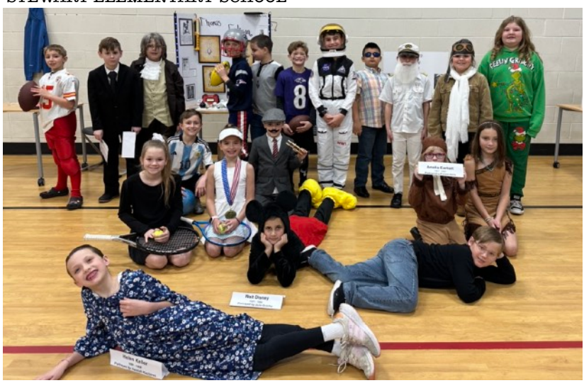
Congratulations on a Job Well Done!

It was great seeing so many parents, grandparents, and family members at our Wax Museum. The kids did such a good job! The students were all very excited to see the many comments people wrote in their biographies. I will be scanning these biographies this week and students will be able to bring them home when I finish. I would like to link their biographies to our webpage to use as anchor papers (examples of awesome writing) in the future. Please let me know if you do not want me to link your child's biography.